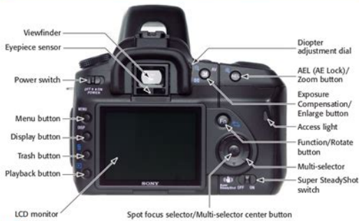
1.3 A rear view of the A200

Chapter 1 + Exploring the Sony Alpha DSLR-A200 17